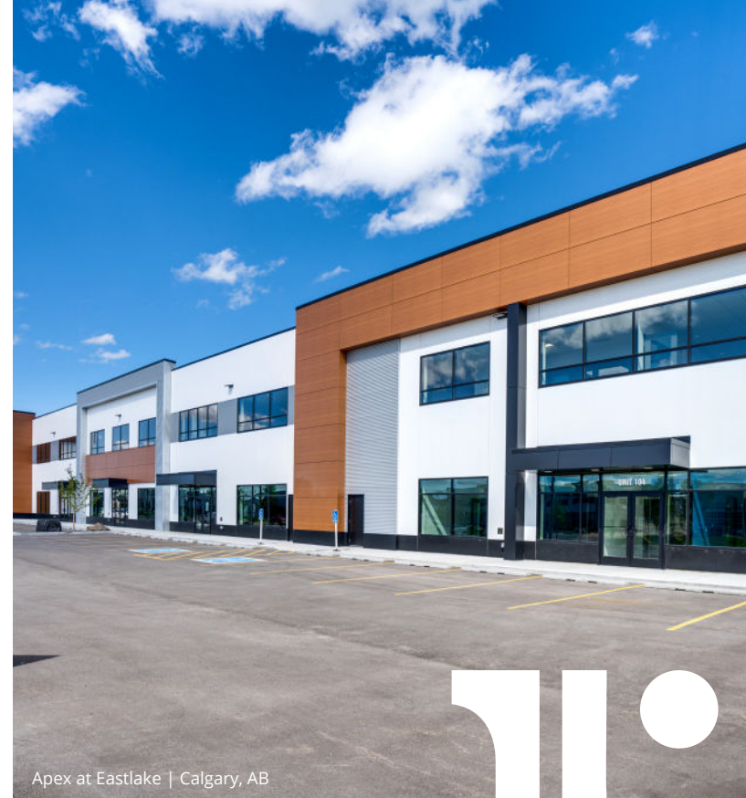
Apex at Eastlake | Calgary, AB