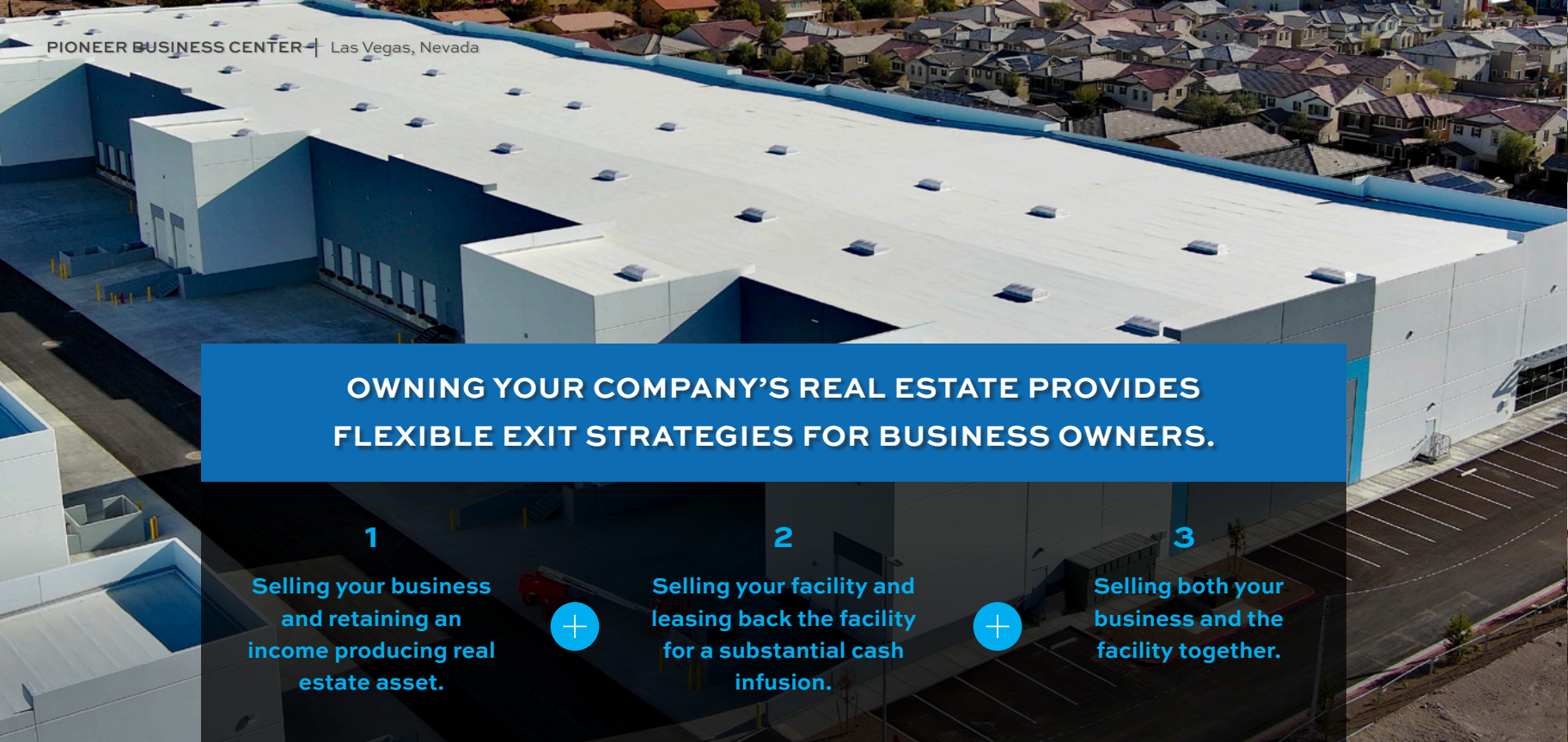
PIONEER BUSINESS CENTER | Las Vegas, Nevada