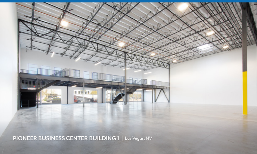
PIONEER BUSINESS CENTER BUILDING 1 | Las Vegas, NV

Experience the freedom and stability of controlling your own space and setting your own terms.