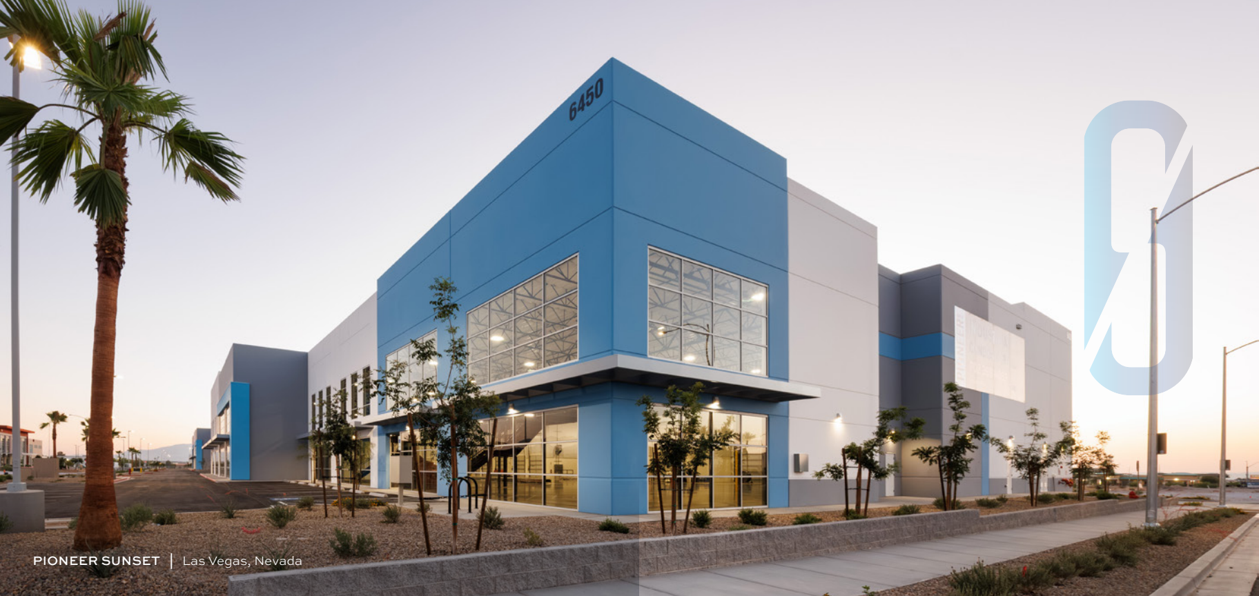
PIONEER SUNSET | Las Vegas, Nevada