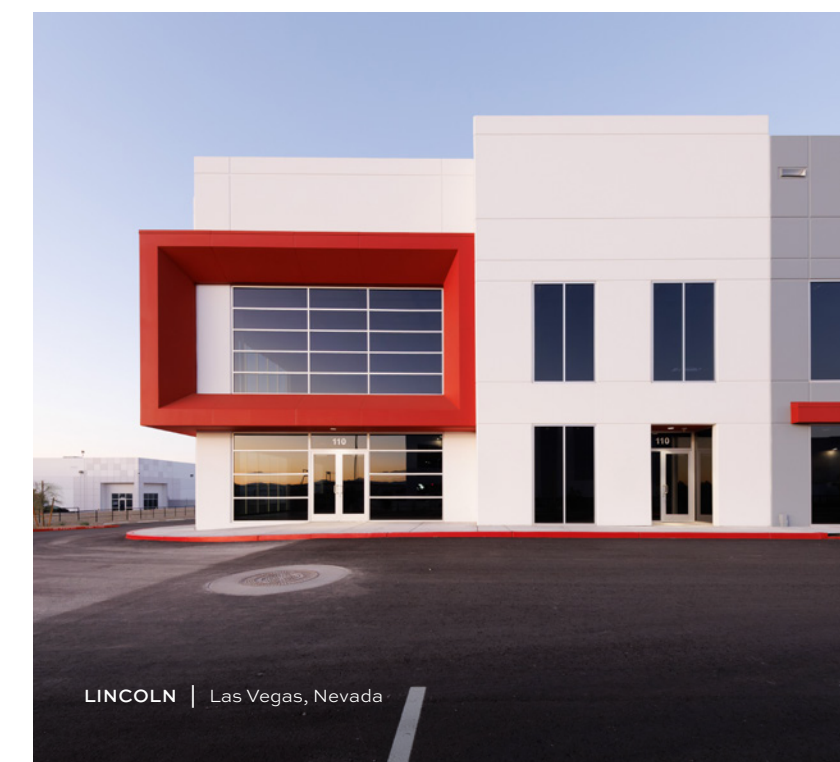
LINCOLN | Las Vegas, Nevada