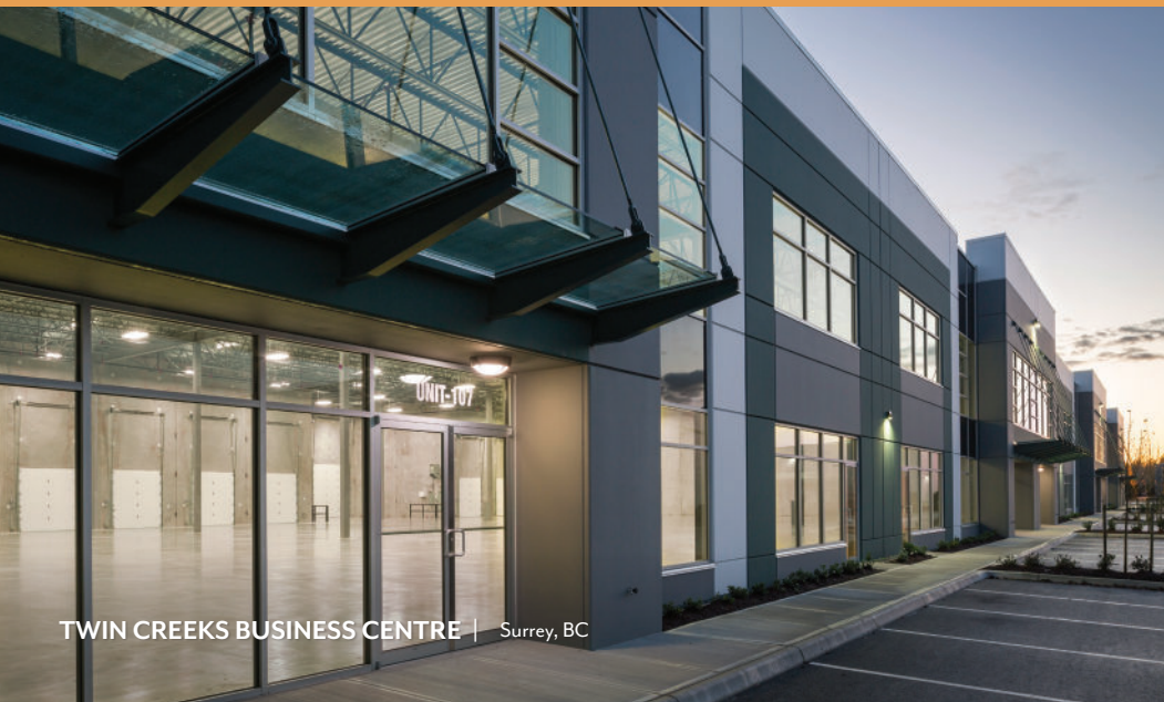
TWIN CREEKS BUSINESS CENTRE | Surrey, BC

By purchasing a brand new building, you minimize your businesses exposure to large capital repairs / replacements for the first 15 years of ownership.