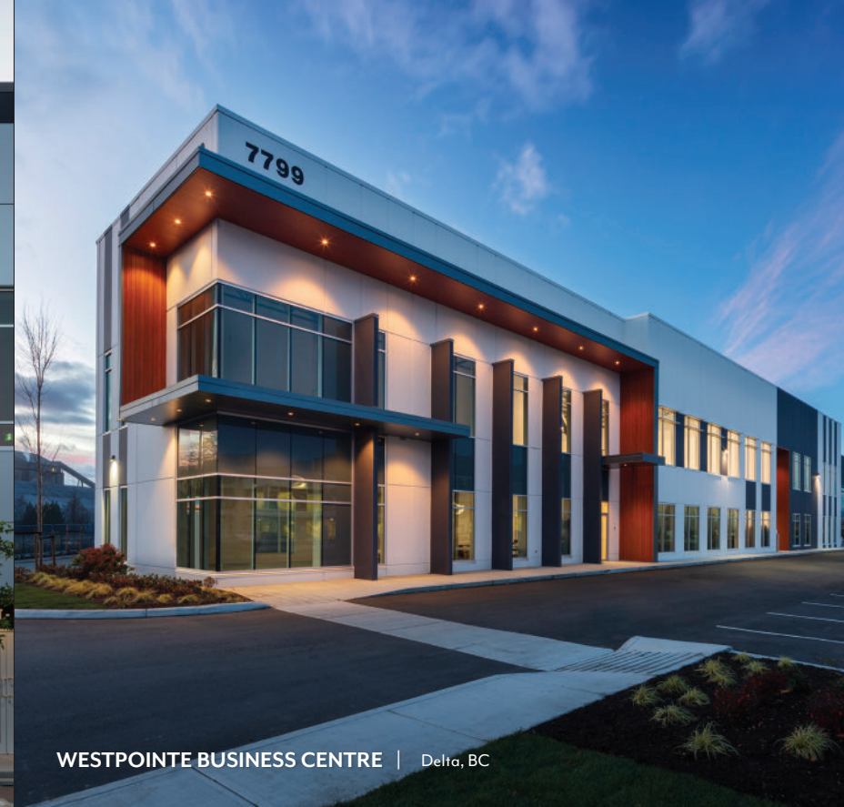
WESTPOINTE BUSINESS CENTRE | Delta, BC