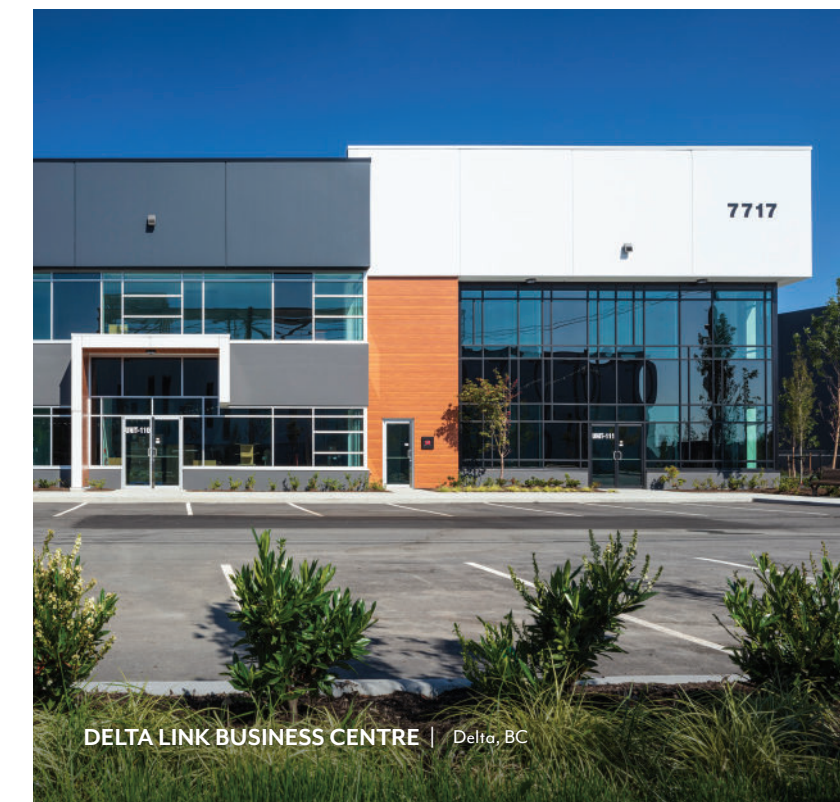
DELTA LINK BUSINESS CENTRE | Delta, BC

Over the past decade, Beedie has worked with local businesses and watched them grow – from being tenants, to purchasing their first condo unit, to owning multiple condo units and eventually, developing custom built-to-suit facilities.