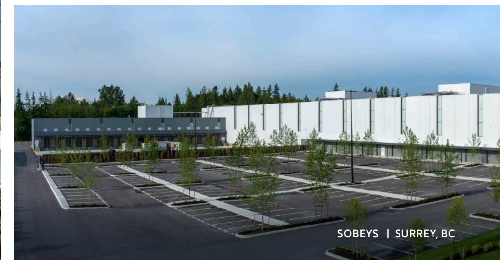
SOBEYS | SURREY, BC