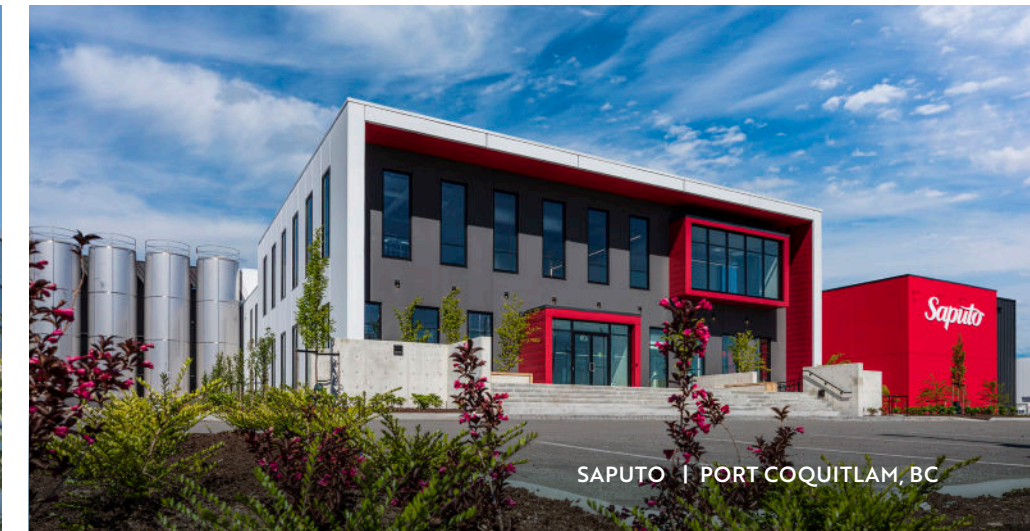
SAPUTO | PORT COQUITLAM, BC