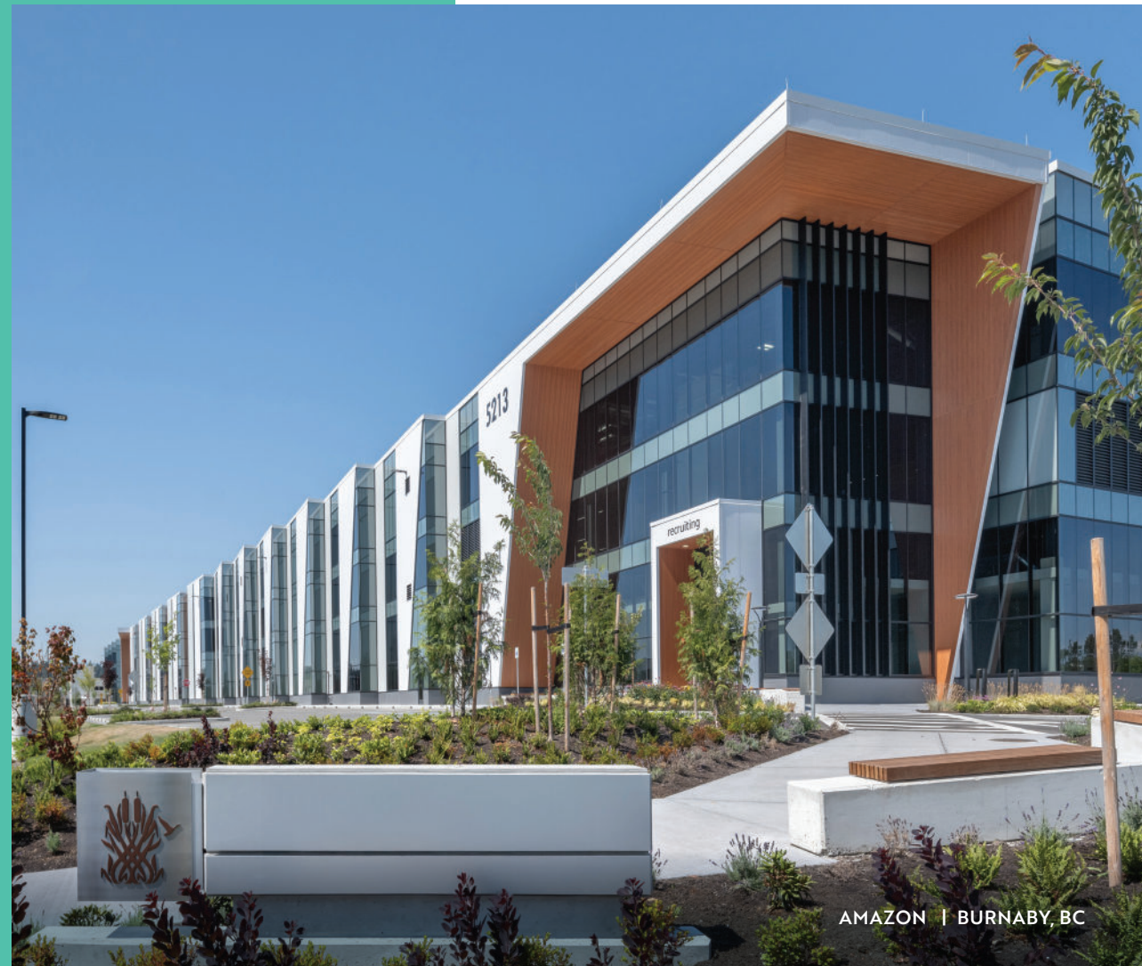
AMAZON | BURNABY, BC